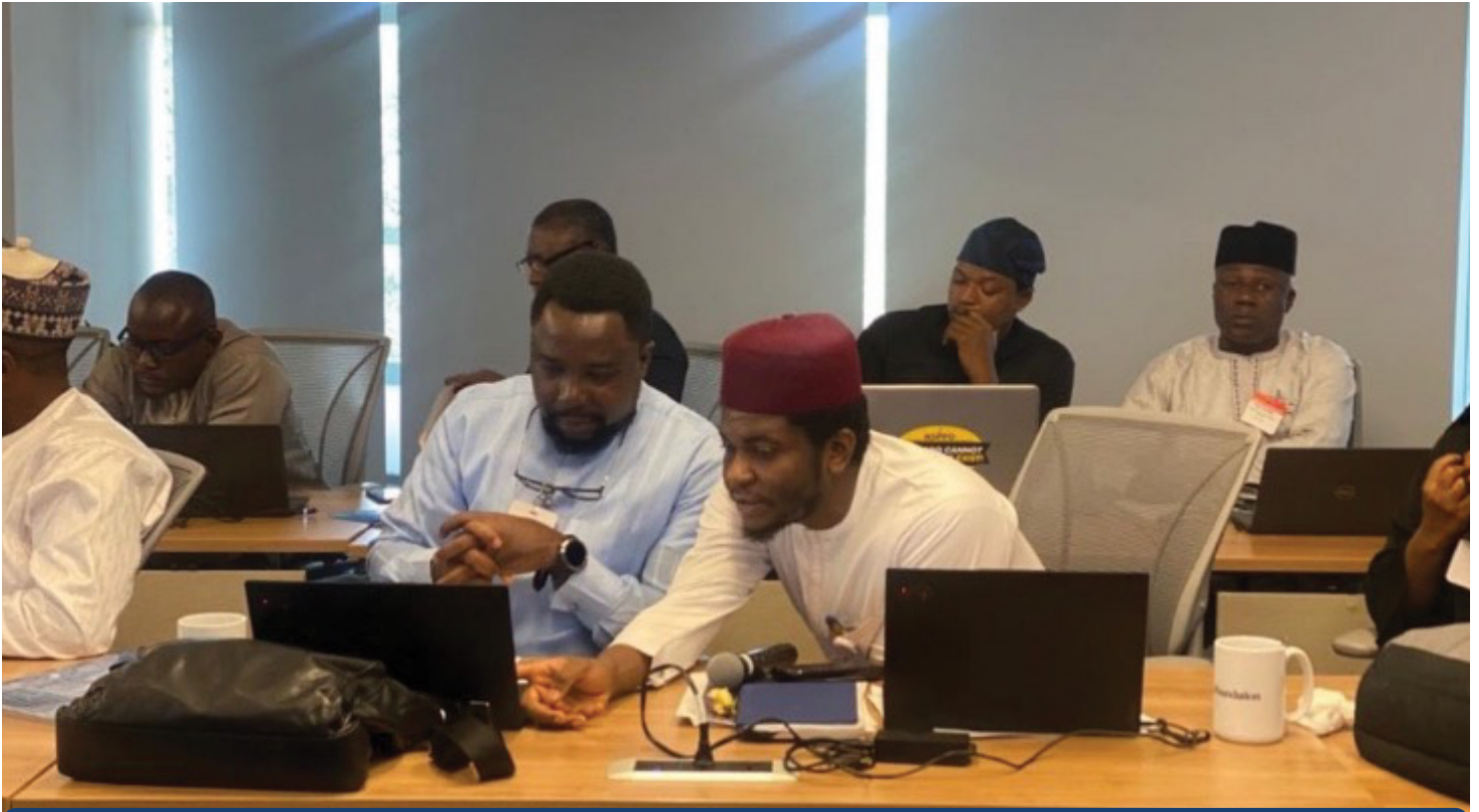
Kaduna State execution grant orientation meeting with State leadership and funders (Gates Foundation)