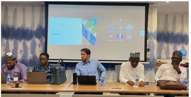
Kaduna State execution grant orientation meeting with State leadership and funders (Gates Foundation)