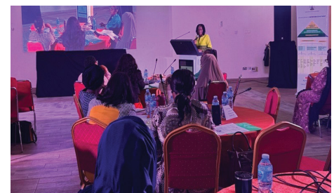
Opening remark by the Head of Nutrition Department at the 1st Quarter National Nutrition Technical Working Group (NNTWG) Meeting