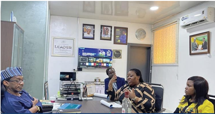
Stakeholder Engagement with Permanent Secretary, Lagos Health district VI