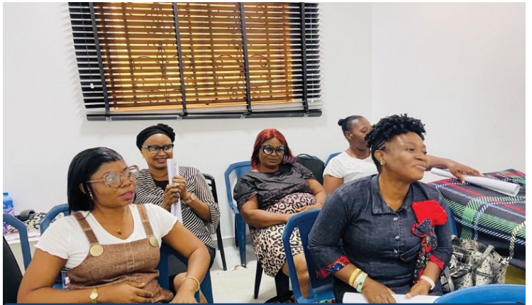
Private facility cluster meeting