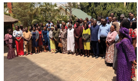
Cross section of stakeholders at the 1st Quarter National Nutrition Technical Working Group (NNTWG) Meeting

Concurrently, through the Finance Capacity Development Platform (FCDP), HSDF is supporting the Federal Ministry of Budget and Economic Planning to inform Nigeria’s next National Nutrition Plan (2026–2030). Drawing on lessons from the recently concluded National Multisectoral Plan for Food and Nutrition (2021–2025), the team is helping translate evidence into strategy. With the potential to reach an estimated 3.5 million malnourished children across Nigeria and Somalia, this work reinforces HSDF’s role as a key thought partner in shaping national nutrition policy across Africa.