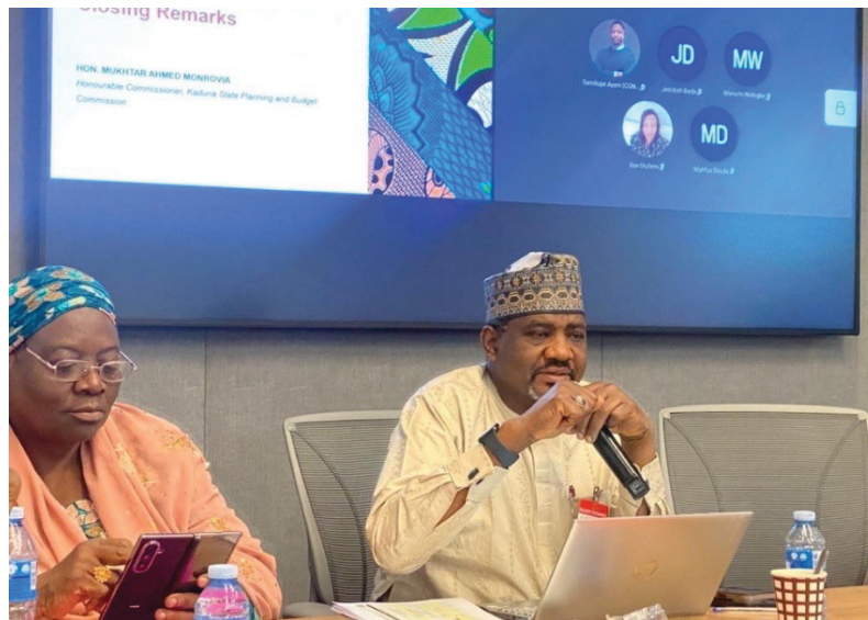
The Hon. Commissioner of Planning and Budget Commission delivering the closing remarks on behalf of Kaduna State leadership after the Orientation alongside the Hon. Commissioner of Health.

The Kaduna State Service Delivery Project (KSSDP) is advancing efforts to institutionalize expenditure tracking across all 23 Local Government Areas (LGAs). Under the Gates Foundation-supported PHC Execution Grant, HSDF has introduced Primary Healthcare Expenditure Tracking across 23 PHC Centres of Excellence bringing, for the first time, clear visibility to revenue and expenditure patterns across the state.