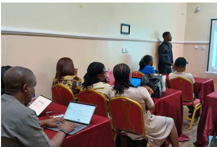
Enumerator Training in Anambra State

Working across multiple national agencies including NTBLCP, NHIA, NASCP, NACA, and several state-level agencies, this evaluation demonstrates HSDF capacity as a trusted leader in evaluation design and methodology across the continent.