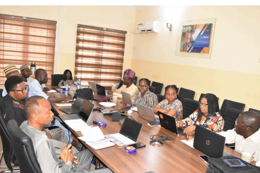
Discussions at the PEN-PLUS operational plan presentation.