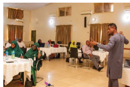
Workshop session during the DRF/financial mgt workshop for DRF committee members in Niger state.