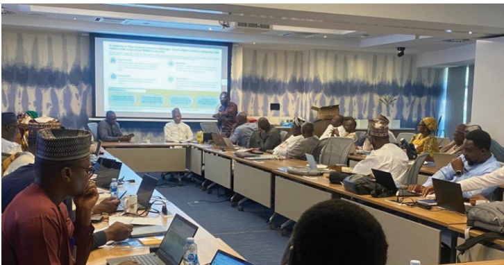
Cross section of stakeholders at the 1st Quarter National Nutrition Technical Working Group (NNTWG) Meeting