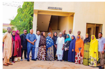
Group photo from DRF/financial mgt workshop in Niger state showing DRF committee members from the SMOH, State PHC Devpt Agency, Drug mgt Agency and State Health Insurance Agency (NiCare).

Under the PPH Project in Niger and Kano States, the organization is strengthening state capacity to operationalize Drug Revolving Funds (DRFs), with a focus on ensuring uninterrupted access to postpartum haemorrhage commodities at health facilities. Newly deployed State Technical Assistants are supporting implementation on the ground, while a policy brief published in March 2026 outlines a pathway for sustainable access to heat-stable carbetocin (HSC) as a key intervention for reducing maternal mortality in Nigeria.